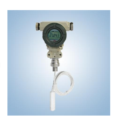
Anti-corrosion Type Liquid Level Transmitter