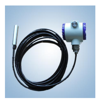
Submersion Type Liquid Level Transmitter

GLP2881 liquid level transmitter had developed by introduce advanced U.S. NoVa company diffusion silicon pressure sensor and IC Sensors circuit technology, and its application with two world advanced technology of the silicon fine corrosion process and silicon wafer composite, it is a high quality of static pressure type level measurement instrument and be widely used in petroleum, chemical industry, metallurgy, environmental protection, food, water, urban water supply, oil field industries such as level measurement. GLP2881 liquid level transmitter with excellent quality, a variety of installation convenient for field installation process, special occasions can be specially designed. Meet some needs of the industrial automation in China and the industry of the measurement precision of liquid level instrumentation.